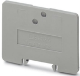
Partition plate, length: 42.5 mm, width: 2.5 mm, height: 30.5 mm, color: gray

Please be informed that the data shown in this PDF Document is generated from our Online Catalog. Please find the complete data in the user's documentation. Our General Terms of Use for Downloads are valid ( http://phoenixcontact.com/download )